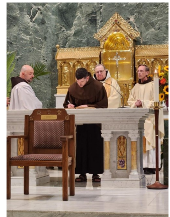
Signing the Book of Friars