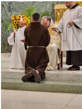
Kneeling while taking his vows