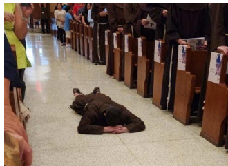
Praying during the Litany of